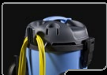
Handy cord holder