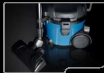
The suction tube holder is very useful for storing the vacuum cleaner