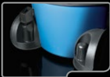
The handy accessory holder enables to work with all the accessories within easy reach