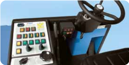
DASHBOARD OF THE DIESEL-POWERED VERSION

For easier machine operation, Mg1300 is provided with an electronic system to automate all machine functions and to keep constant control of all operating components through a specially designed control panel.