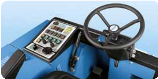
DASHBOARD OF THE BATTERY-POWERED VERSION